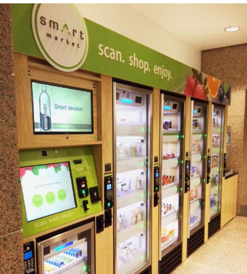
ON-SITE SMART MARKET