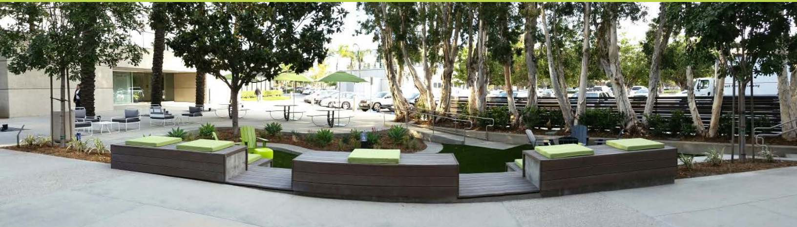
NEW LANDSCAPE/HARDSCAPE, & OUTDOOR SEATING