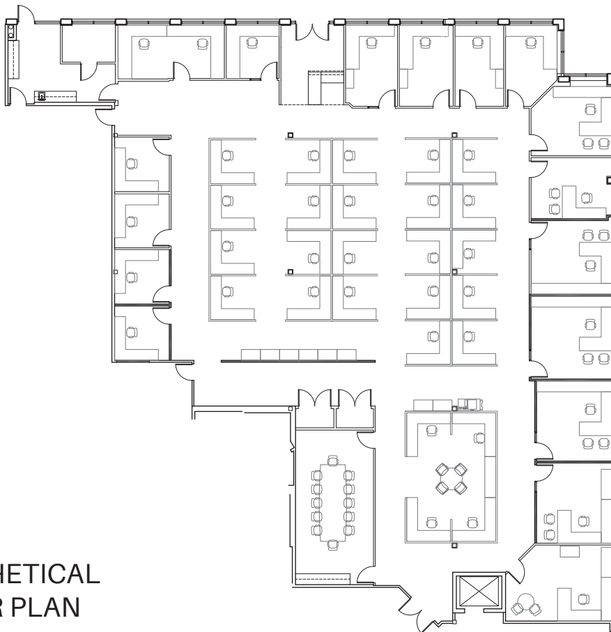
HYPOTHETICAL FLOOR PLAN